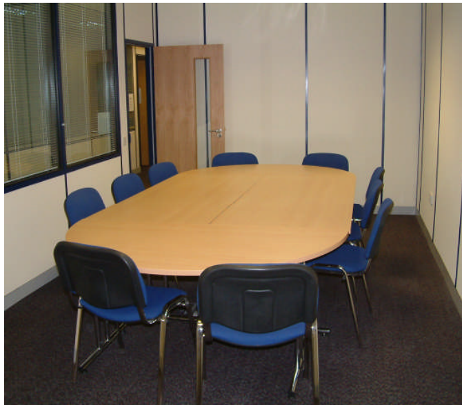
Small Meeting Room,