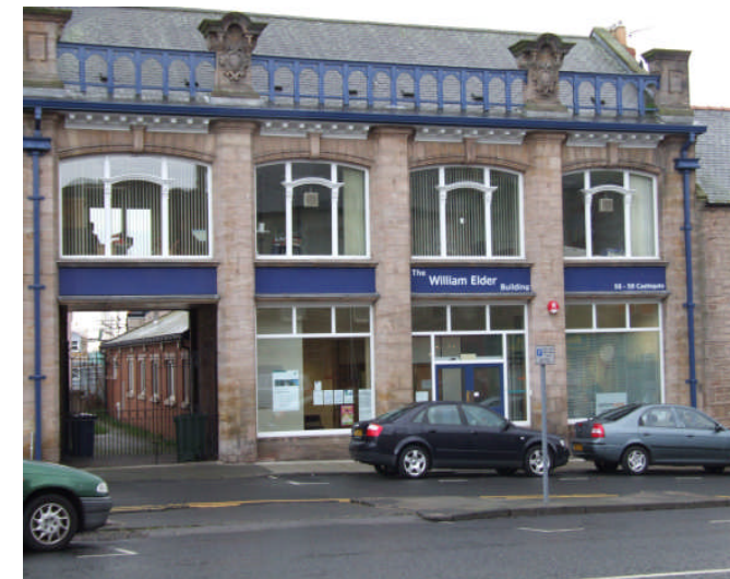
The William Elder Building 56—58 Castlegate Berwick-upon-Tweed TD15 1JT